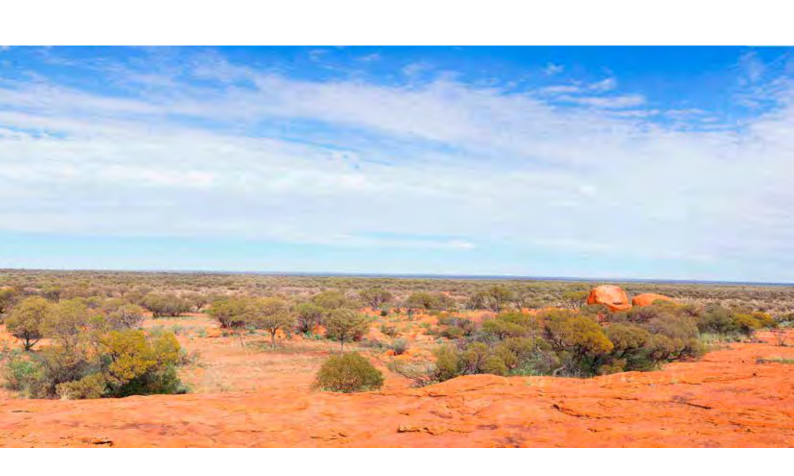
Section 1 Introduction