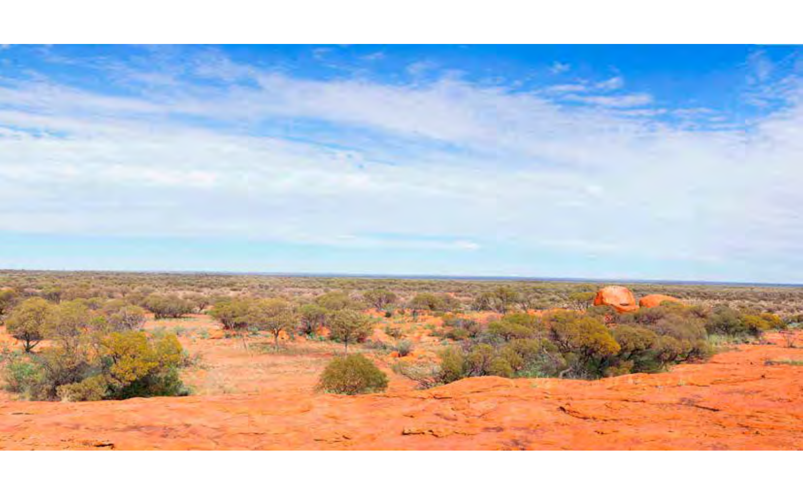
Section 11 Other Factors